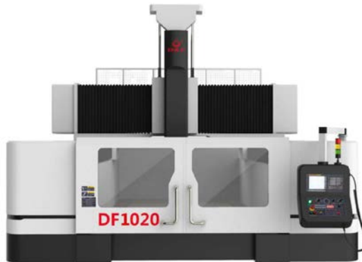
Fig 3 De Feng precision CNC machine tool

short production cycle, high precision and stable quality.