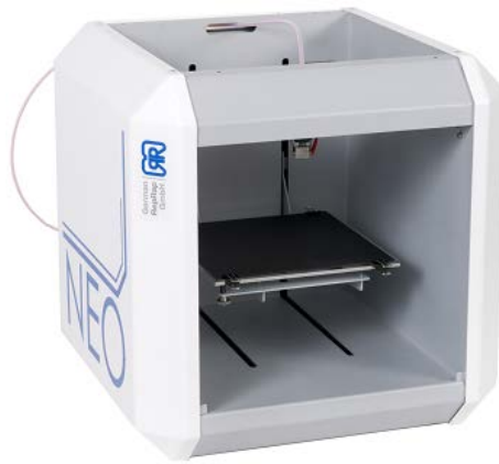
Fig 1 NEO home 3d printer

3D printing (as shown in Fig. 1) is a rapid prototyping technology. Based on the digital model, the entity can be printed layer by layer using the adhesive materials such as powdered metals or plastics [5]. With the development of technology, it has gradually replaced the mode of traditional manufacturing industry. 3D printing has high precision and can print out model details in a fine manner. Compared with traditional methods such as stamping and etching, it can create model more quickly. 3D printing model (as shown in Fig. 2) is a kind of additive manufacturing. Generally, it can use all kinds of metal or non-metal and composite materials to overlay quickly, with time-efficiency and diversity of materials. Large model needs to be divided into multiple parts that are individually printed and glued to avoid problems such as damage of large model parts, excessive supports and waste of materials. Design and manufacture of solid models: three-dimensional software modeling, equipping printers with hierarchy-sliced software, printing models, painting and polishing, finishing and coloring, etc.